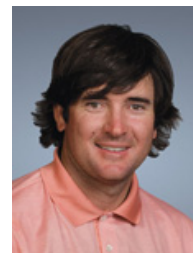
Defending Champion: Bubba Watson Country: United States Best Masters Finish: 1

Entries Must Be Turned In By Tee Off Time On Thursday